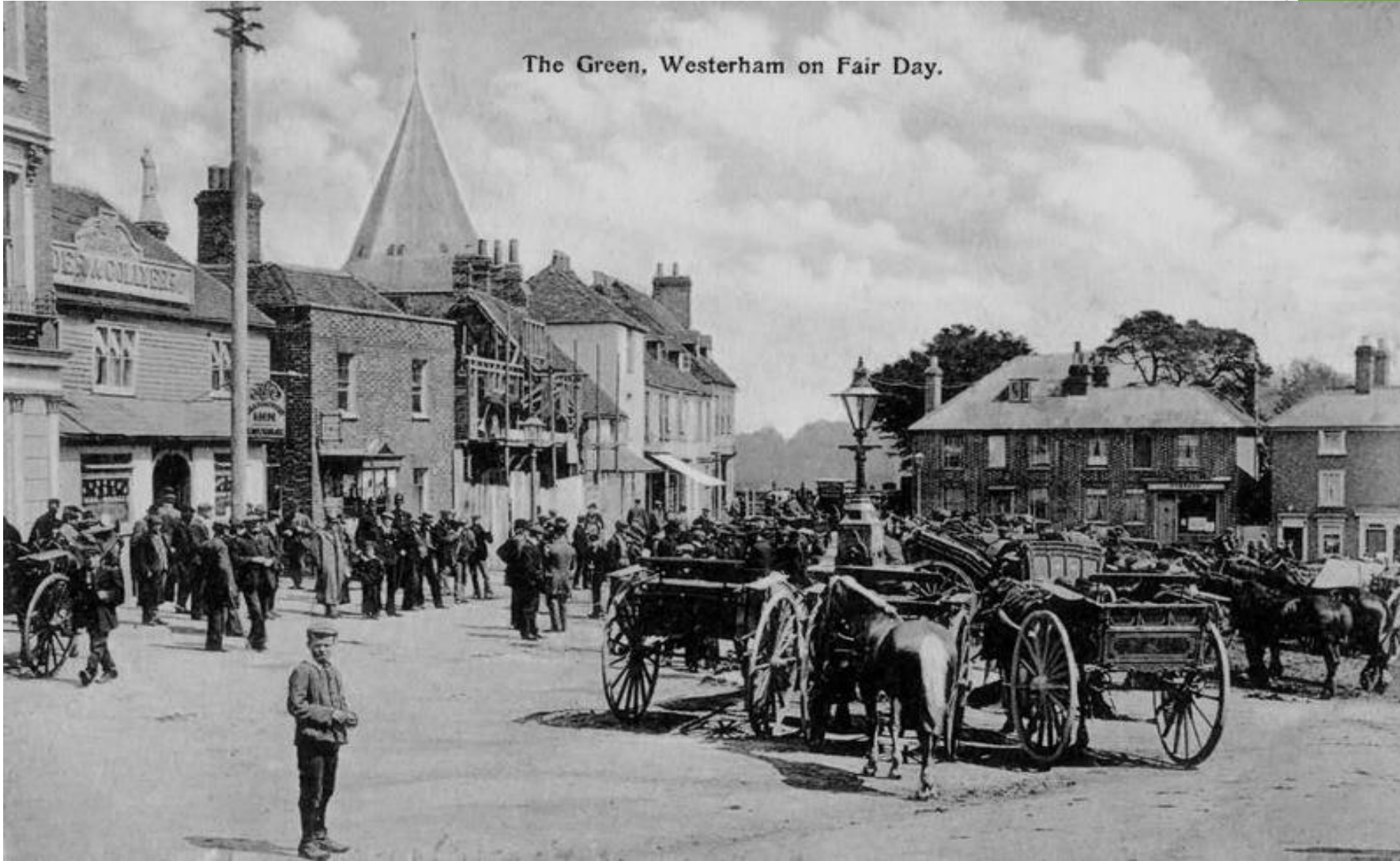
The Green, Westerham on Fair Day.