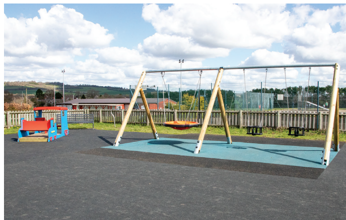
Refurbished playground, King George's Field