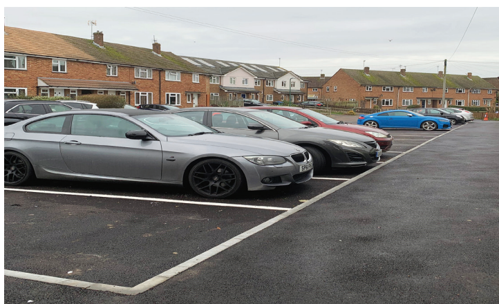
Extra parking in Hartley Road

Phases 4 & 5: Trim trail around the Field, Multi use games area and Pavilion. 2024 onwards