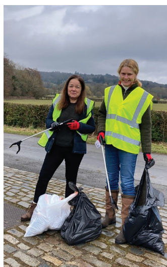
Residents Litter Picking in Crockham Hill