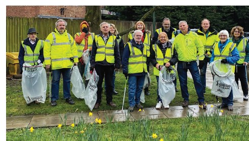
Litter Pickers March 2023