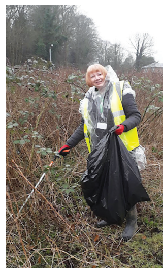
The Town Clerk litter picking adjacent to the River Darent